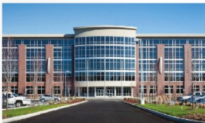
▲ Horizon Properties designed the 180,000 sq. ft. building that was constructed by P.J. Dick Corporation, making it one of the largest recent construction projects in Southwest PA.