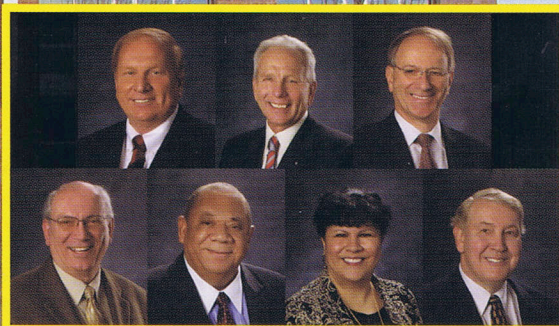
2012 Southpointe Chamber Board Members